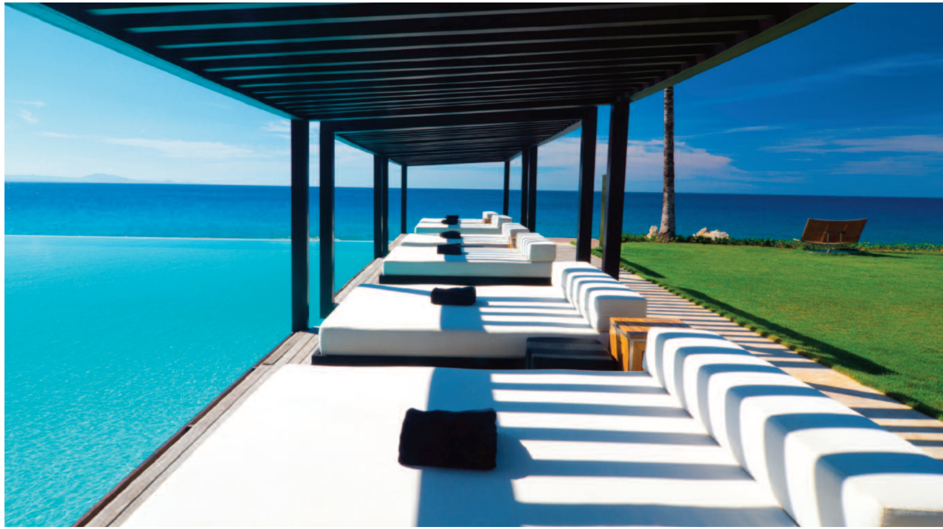
Clockwise from above: the infinity pool at the Gansevoort Dominican Republic, Playa Imbert; view of the Caribbean from Hotel Guanahani & Spa, St. Barths; fruit basket from Belle Mont Farm, St. Lucia.