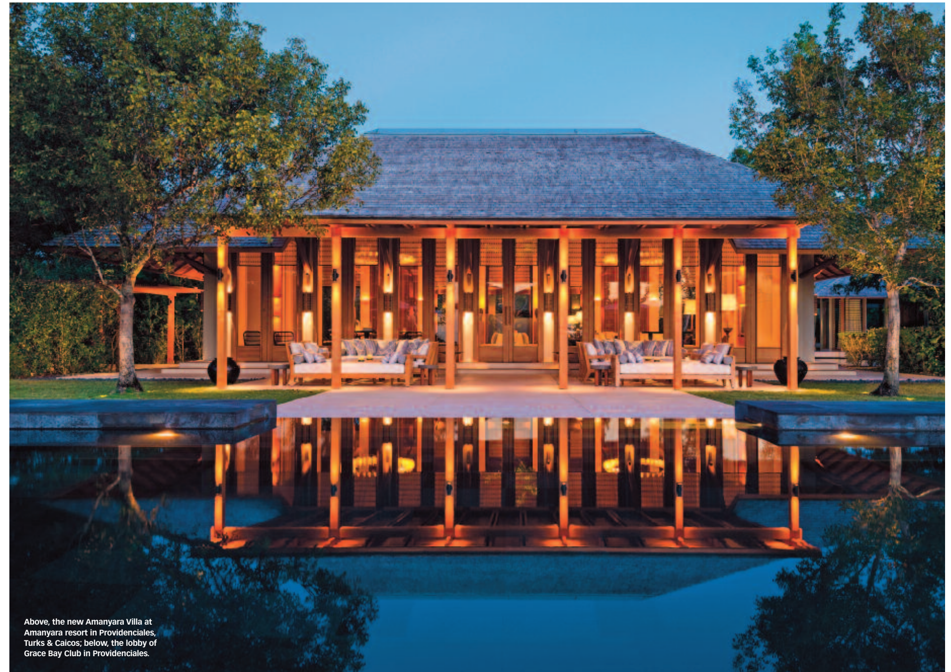
Above, the new Amanyara Villa at Amanyara resort in Providenciales, Turks & Caicos; below, the lobby of Grace Bay Club in Providenciales.

TRADEWIND AVIATION Good news, island hoppers: inter-island travel just got an upgrade thanks to new regularly scheduled services by Tradewind Aviation. A fleet of contemporary Pilatus PC-12s—each equipped with two pilots, leather seating and food and beverage amenities—now connects the islands of St. Barths, Puerto Rico, St. Thomas, Antigua, Anguilla and Nevis.