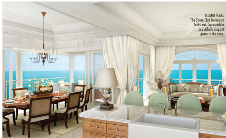
ISLAND PEARL The Shore Club homes on Turks and Caicos add a beautifully elegant grace to the area.

THE BUZZ Since breaking ground in January 2014, construction on Shore Club in Providenciales, Turks and Caicos has been progressing at a rapid-fire pace. Set to debut in early 2016 and now available as pre-sales, the Shore Club comprises two luxury low-rise buildings with a total of 38 two- and three-bedroom furnished condos as well as six luxury villas cast over nine pristine beachfront acres. The Hartling Group anticipates the Shore Club will "establish a new standard of condominium resort luxury" in Turks and Caicos and usher in a new era of greatness on the island.