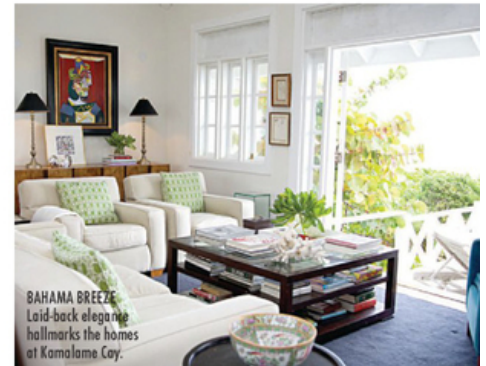
BAHAMA BREEZE Laid-back elegance hallmarks the homes at Kamalame Cay.