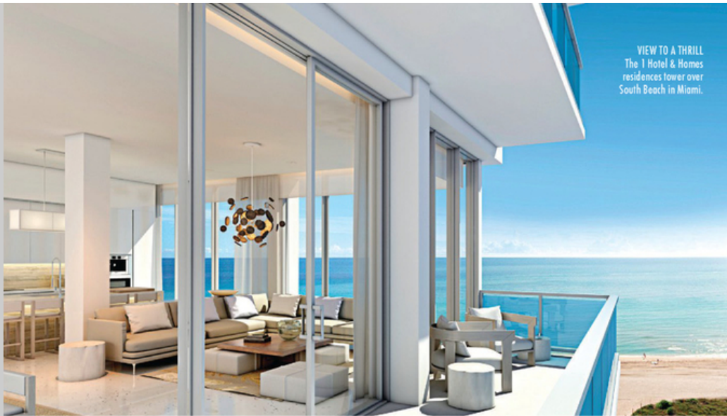
VIEW TO A THRILL The 1 Hotel & Homes residences tower over South Beach in Miami.