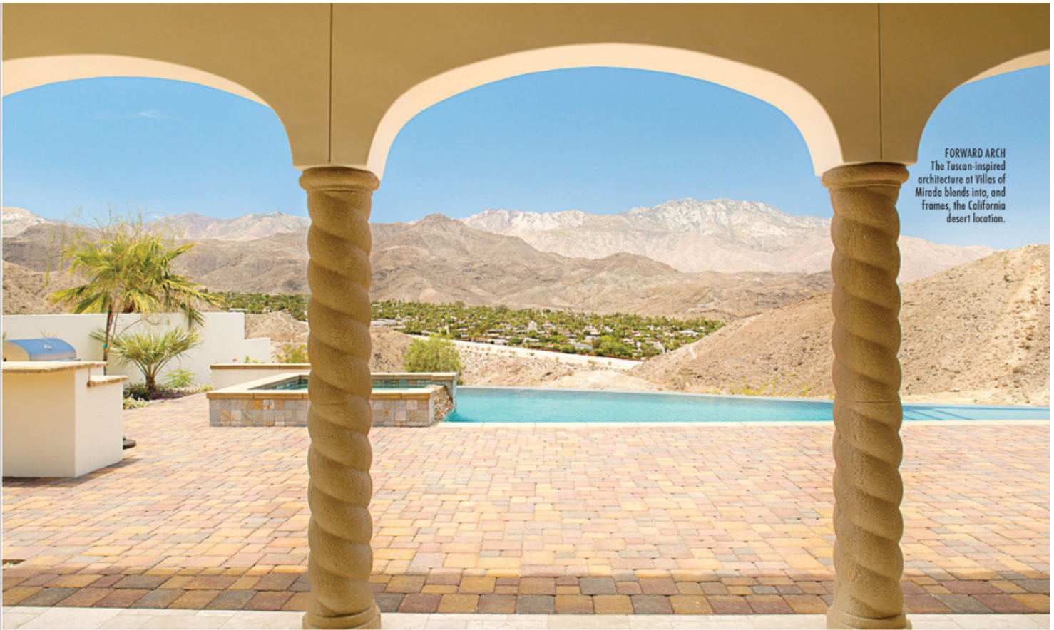
FORWARD ARCH The Tuscan-inspired architecture at Villas of Mirada blends into, and frames, the California desert location.