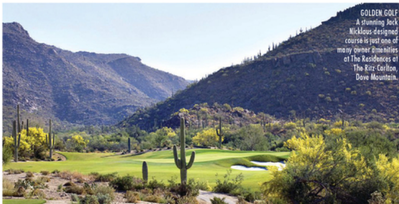
GOLDEN GOLF A stunning Jack Nicklaus-designed course is just one of many owner amenities at The Residences at The Ritz-Carlton, Dove Mountain.