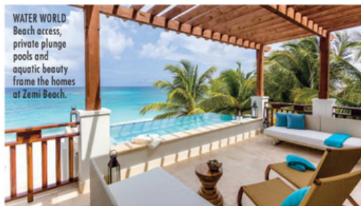
WATER WORLD Beach access, private plunge pools and aquatic beauty frame the homes at Zemi Beach.