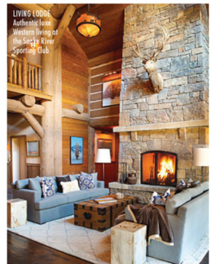
LIVING LODGE Authentic luxe Western living at the Snake River Sporting Club