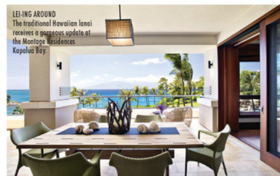
LEI-ING AROUND The traditional Hawaiian lanai receives a gorgeous update at the Montage Residences Kapalua Bay.

MORE DETAILS montageresidenceskapaluaabay.com