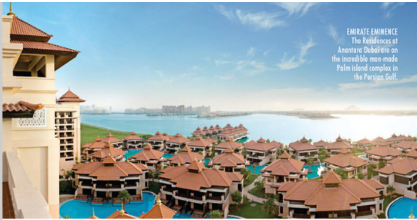
EMIRATE EMINENCE The Residences at Anantara Dubai are on the incredible man-made Palm island complex in the Persian Gulf.