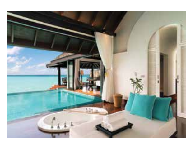
AT ANANTARA KIHAYAH, GUESTS CAN DINE IN THE SAND AND TAKE IN THE YIEWS IN THEIR OVERWATER POOL VILLA (ABOVE). NIYAMA'S OCEAN PAVILION SUITE (BELOW) BOASTS A PRIVATE INFINITY-EDGE POOL.

160-feet long, Anantara Kihavah's principal infinity pool is one of the Maldives' largest. Five beautifully appointed restaurants satisfy all foodie cravings from Mediterranean fare to local catch to Japanese teppanyaki, but you can also choose to dine on a private sand bar or in your villa.