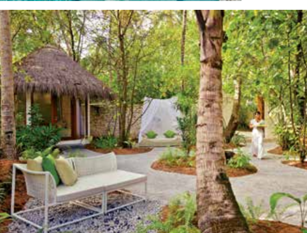
NIYAMA PRIVATE ISLANDS MALDIVES OFFERS AMPLE LOCALES THAT PRIORITIZE LAID-BACK LUXURY, INCLUDING THE DRIFT SPA (ABOVE) AND THE TREE-TOP NEST RESTAURANT (LEFT).