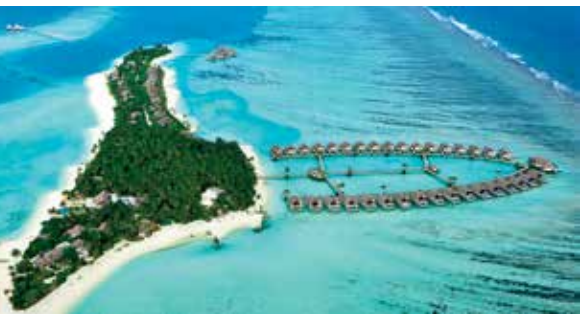
DRESSED IN CONTEMPORARY DECOR, NIYAMA'S TWO-BEDROOM OCEAN PAVILION (ABOVE) IS LARGE ENOUGH FOR A FAMILY, AN AERIAL VIEW OF NIYAMA (LEFT) HIGHLIGHTS ITS OVERWATER ACCOMMODATIONS.

Having said that, families with a penchant for all things overwater can choose from a private cluster of villas called the Crescent, which can accommodate groups traveling together, up to 14 adults and eight children.